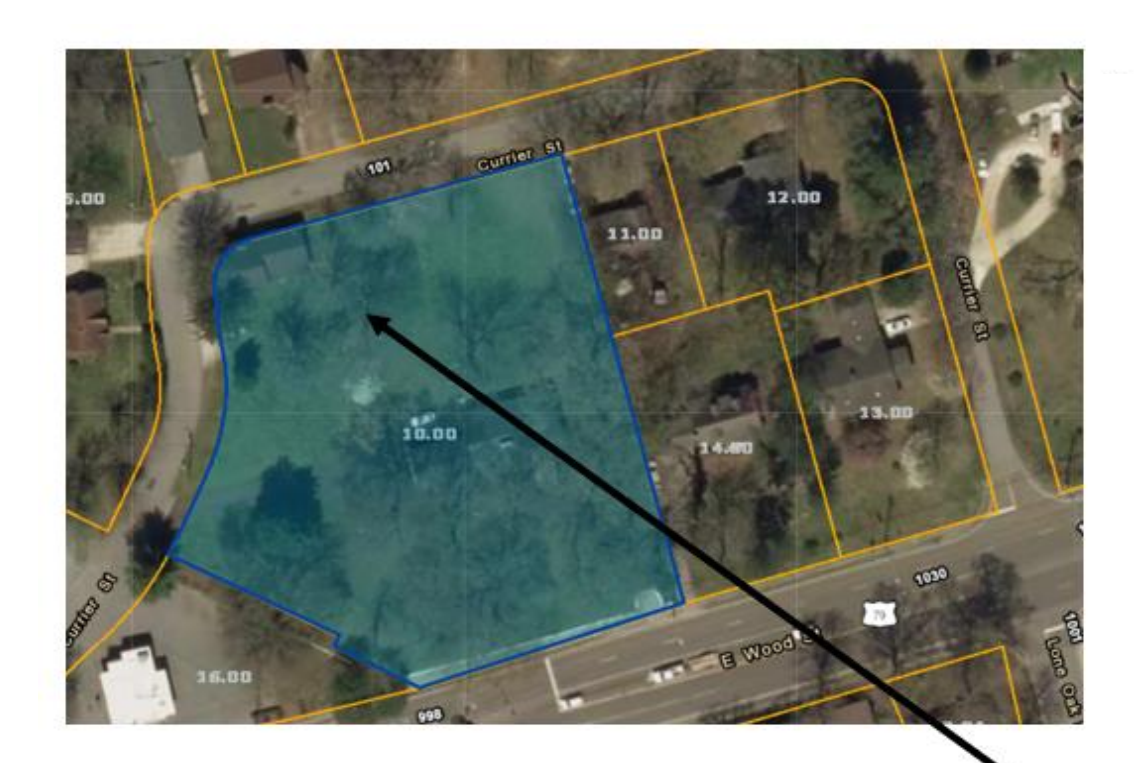
Area Requested to be Rezoned From R-2-M (Residential) to P-B (Commercial)